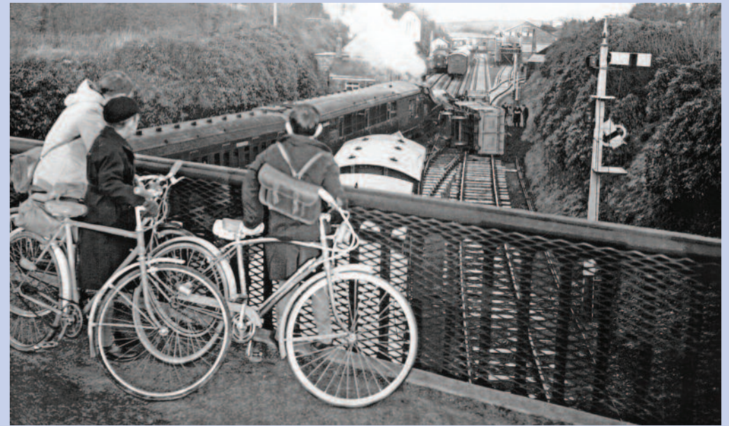
Above: Due to a combination of a signalling fault and human error on 7 Dec 1961 the 6.58am Wadebridge to Bodmin General train hauled by 0-6-0PT 4694 collided with a train being shunted by a GWR 4500 class 2-6-2T as it entered General station.